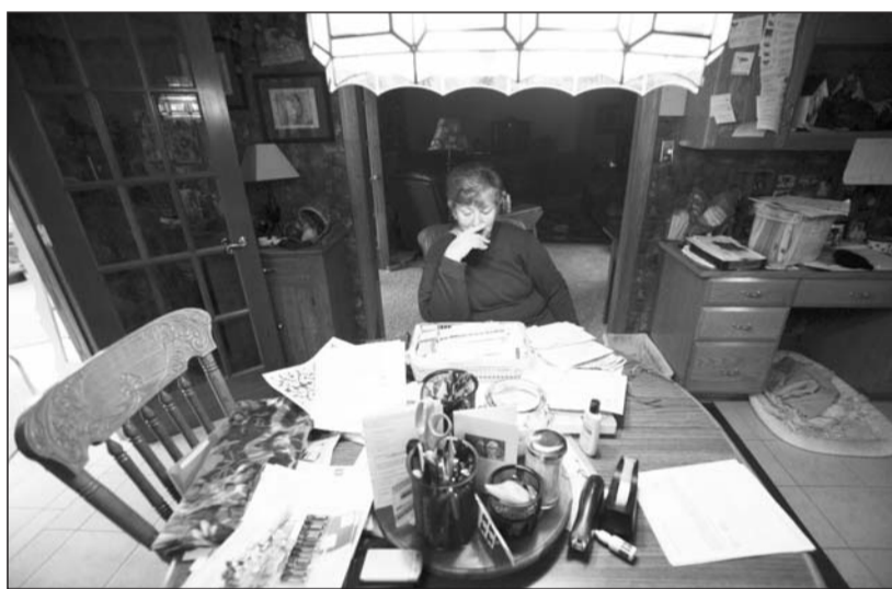
The Associated Press

■ Many eligible jobless Americans are shut out because states use an outdated system for calculating their income, making it more difficult to meet requirements.